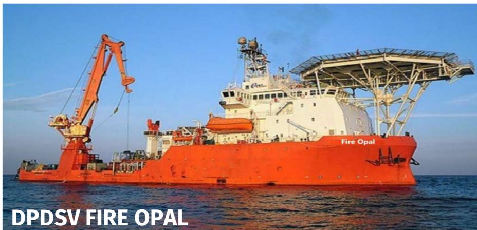
DPDSV FIRE OPAL